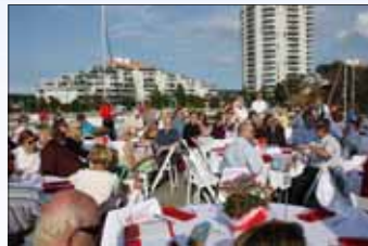
Snowbirds fly For CH.I.L.D. Sponsor & guests have front row seats on the Nanaimo Port Authority Observation Deck.