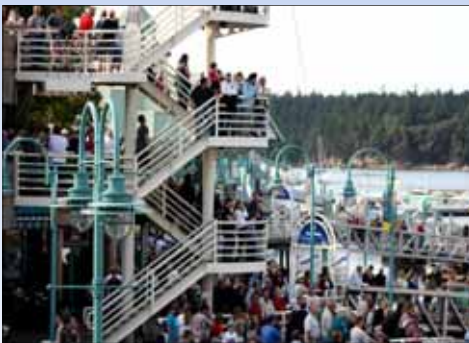
Thousands gather along the Nanaimo Harbourfront to watch Snowbirds Fly for CH.I.L.D.