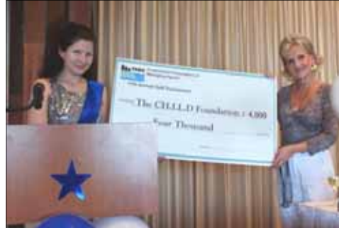
The 17th Annual PAMA Golf Tournament held at Westwood Plateau on July 10th raised over $8,000 for the CH.I.L.D. Foundation.

We appreciate Bradlee Distributors very much for helping the very ill children & families we serve.