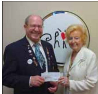
Ron Watson, Worthy Vice President of Fraternal Order of Eagles presents a cheque to Chairman of the Board, Grace McCarthy on behalf of the FOE Aerie #2075.