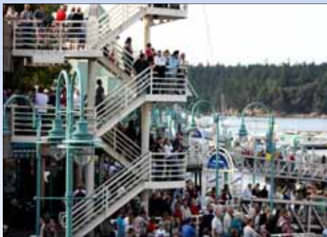
Thousands gather along the Nanaimo Harbourfront to watch Snowbirds Fly for CH.I.L.D.