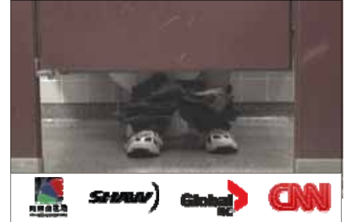
Thank you for the ongoing support from Fairchild Media Group for translating our upcoming events from English into Mandarin and Cantonese so we are better able to reach a broader audience.