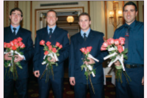
Vancouver Fire & Rescue Volunteers were amazing, selling Roses and Raffle Tickets. Thanks again Gentlemen!