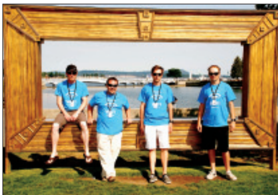
Wonderful volunteers from SHAW Communications gave away bottled water by donation in Maffeo-Sutton Park, with proceeds going directly to research through the CH.I.L.D. Foundation.