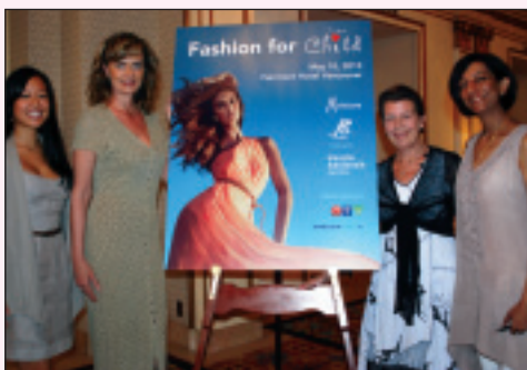
WESTJET Volunteers supplied our Grand Raffle Prize, and were so helpful at registration.