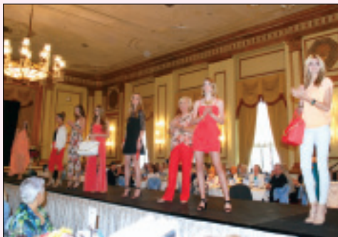
The beautiful models, volunteers from LIZBELL Agency, pose for the audience at the end of the Fashion Show.