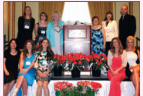
CH.I.L.D. Foundation Volunteers that helped make this event such a great success!