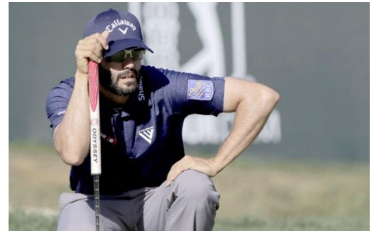
Adam Hadwin, PGA

Hope you enjoyed a lovely Easter and Passover!